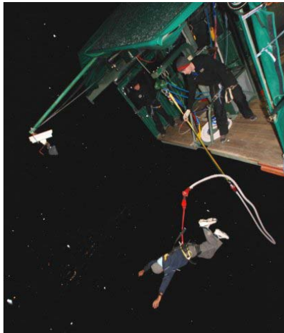
VJ bungee jumping

My job involved Brand Analysis, hence I got to travel the country at my company's expense. It was the first time I was going backpacking. Traveling alone, I felt would take me far out of my comfort zone. As it turns out, a couple of months and a few bungee jumps later I felt completely at home! Modern day commercial Bungee jumping was invented in New Zealand and my boss wanted me to experience the true New Zealand spirit. He was basically paying me to jump off the bridge claiming it was "orientation". So bungee jumping it was and I must admit it is one of the best things I experienced in New Zealand.