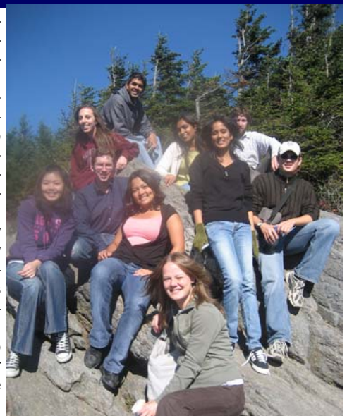
MEMers in Smoky Mountains

The Internal Communication subcommittee has also successfully organized over 95 MEMers, including current students and alumni to participate in the Annual Graduate Student 36 hour Camp-out for basketball tickets. This activity not only gave the new students their exposure to the Duke's basketball experience, but also was a great opportunity to interact with their peers outside of the academic setting.