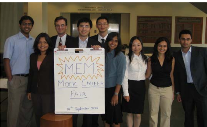
MEMers hosting the Mock Career Fair

The MEM Program Development Committee continues working to strengthen our program by organizing different activities that aim to help our new students in their job searches and with networking. For instance, one of our first activities was a Mock Career Fair organized by our Career Development subcommittee. In this exercise, the MEM class of 2008 had the opportunity to interact with the Class of 2007 students, who had previous work experience in different sectors, to simulate the Career Fair setting. The mock was conducted the day before Duke's Fall Term Career Fair to provide our students with timely feedback on their approach and to provide insight in the following sectors: consulting, finance, business analysis, technology, and marketing.