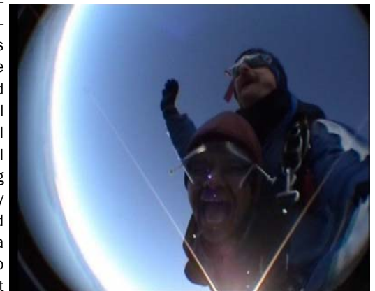
VJ jumping from a plane

I was quite nostalgic since I realized that I was going to leave New Zealand and the wonderful people whom I had met. As I started getting ready for my 1,100 mile road trip in Australia from Brisbane to Cairns (Watch out for that article in the next MEMo-